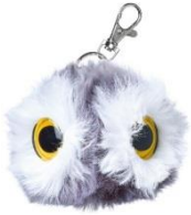
Arctic Owl Fluffy Keyring

Exciting new Term 3 Polar Savers rewards are now available, while stocks last!