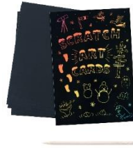
Scratch Art Cards

For every deposit made at school students will receive a silver Dollarmites token. Once students have individually collected 10 tokens they can redeem them for exclusive School Banking reward items in recognition of their regular savings habits. There are two new items released each term so be sure to keep an eye out for them!